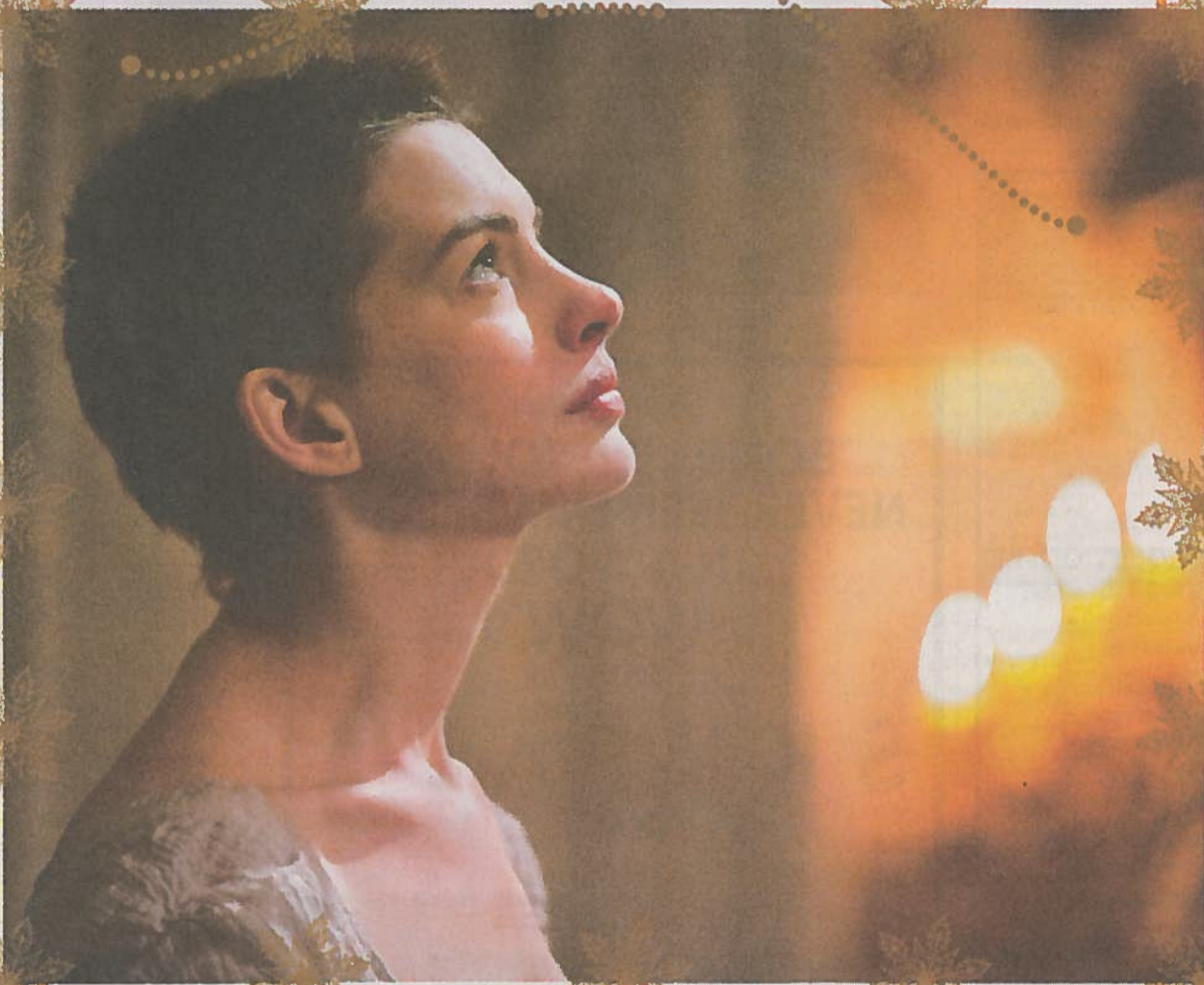
Anne Hathaway stars as Fantine in Les Misérables , which is likely to be a major Oscar contender.